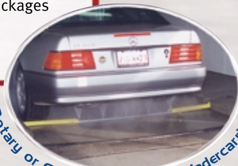
Rotary or Fixed High Pressure Undercarriage