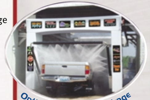
Optional Marketer Package