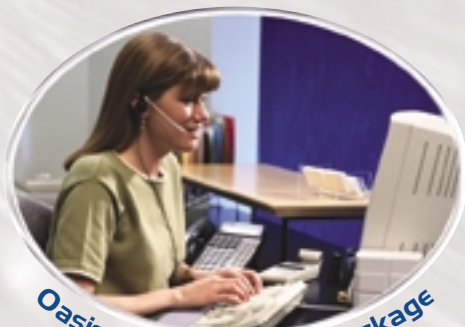
Oasis Communication Package