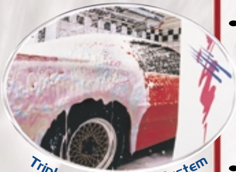
Triple Foam Shine System