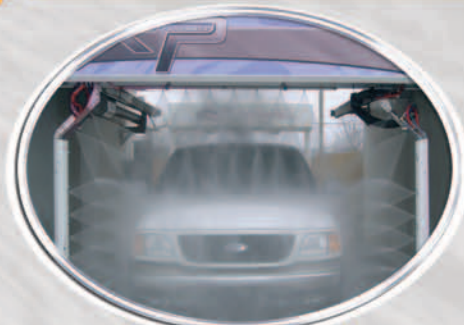
XP Wash Front View