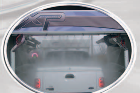
XP Wash Back View