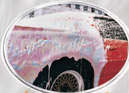
Triple Foam Shine System